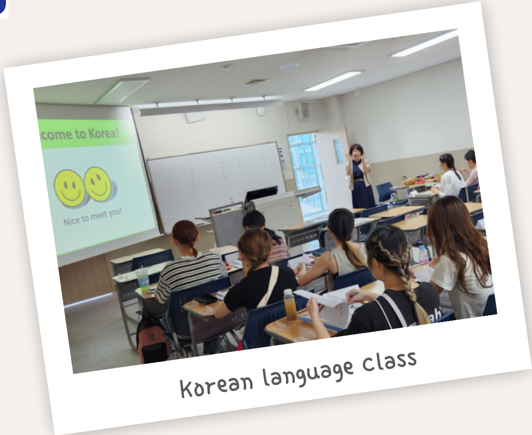
Korean language class