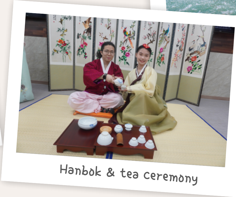
Hanbok & tea ceremony